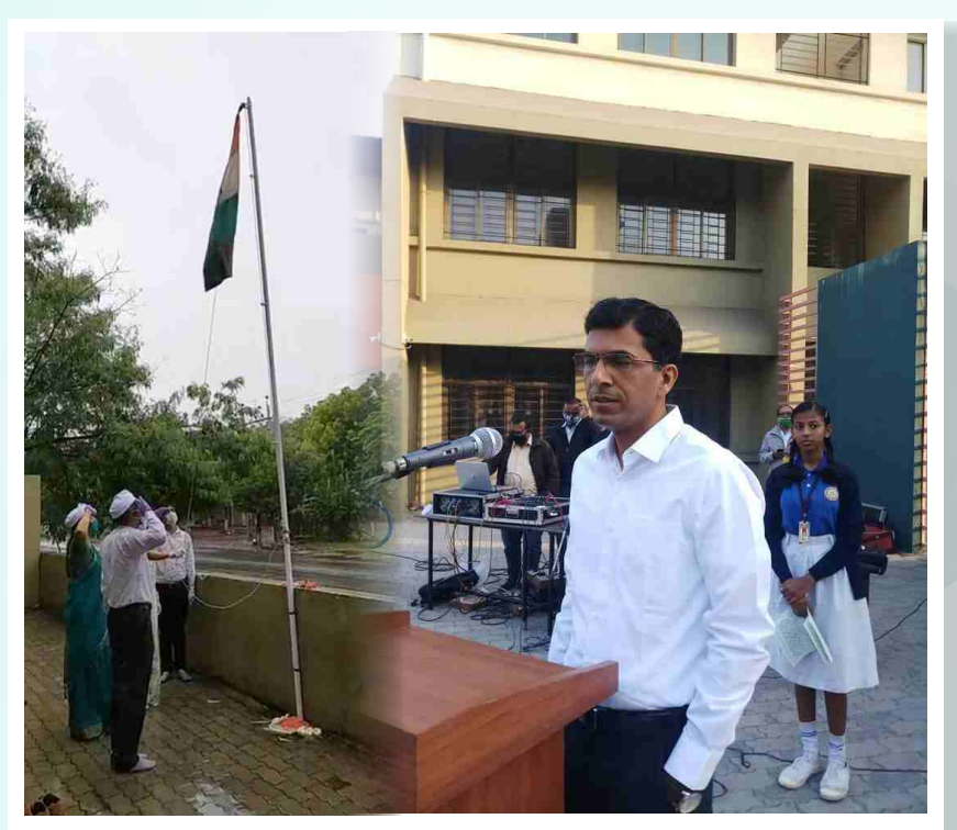
26th January, 2020 Flag Hoisting & Dignitary addressing to students