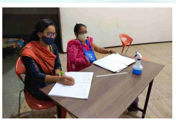
Volunteering for Covid Vaccine Centre Management