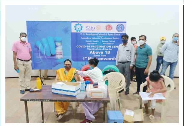
Covid 19 Vaccination Centre