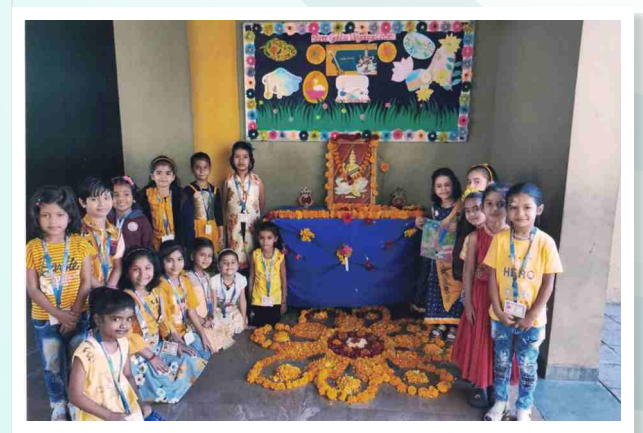
Incarnations of The Supreme Worshiping Goddess Saraswati

The pre-primiary section students invoked the blessings of Goddess Saraswati by offering their prayers. The festival was celebrated with great enthusiasm. The drawing and cut-outs made by children were exhibited on the display board. The children are also exposed to day-to-day activities such as fireless cooking. The students had prepared wonderful and mouth watering delicacies. They were very excited to be budding chefs for a day.