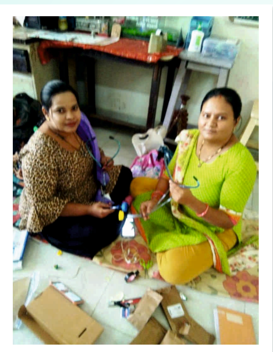
Building Science Projects