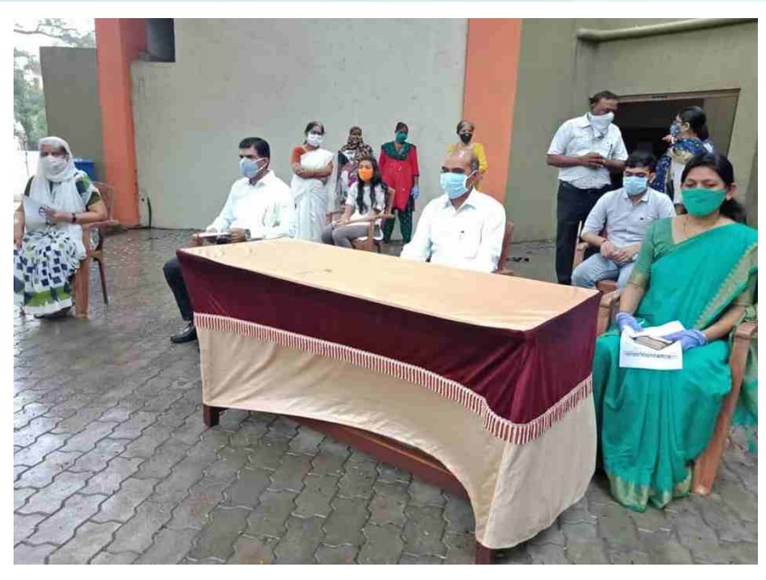
26th January, 2020 - Dignitary on Dias.